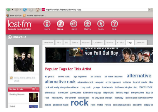
Fig. 1. Most popular tags for a given artist

Here we considered only the resources with 10 or more tag assignments. This gave us 2.917 users, 1.853 artists (playing the role of resources), 2.045 tags and 219.702 instances ((user, resource, tag) triples).